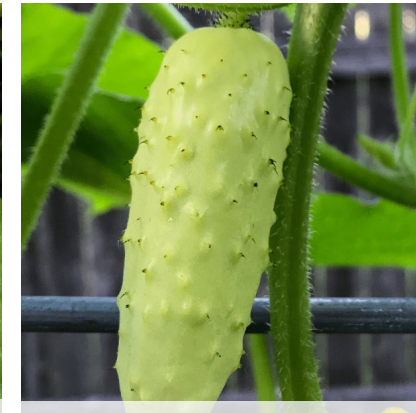
Cucumber- Salt &