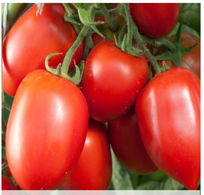
Tomato - Amish Paste