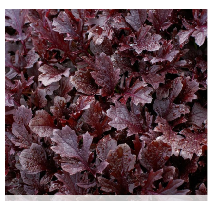
Mustard - Miz America