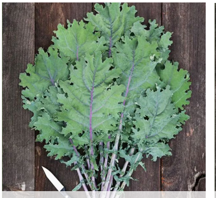
Kale - Red Russian