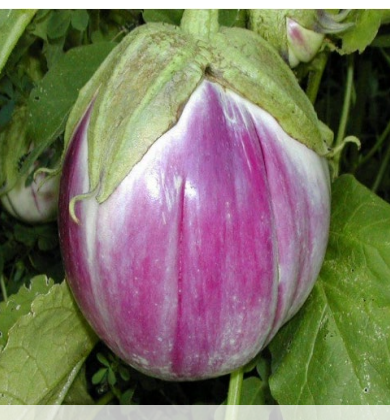
Melongene - Rosa