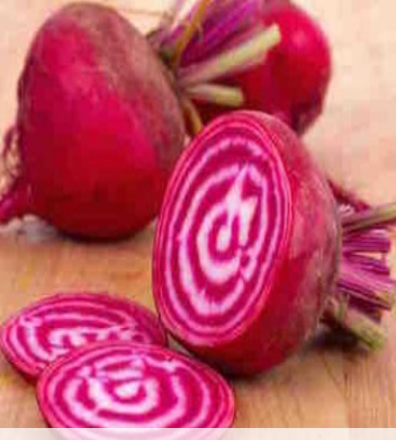
Beets - Chioggia