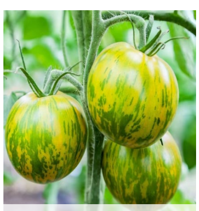
Tomato - Green Zebra