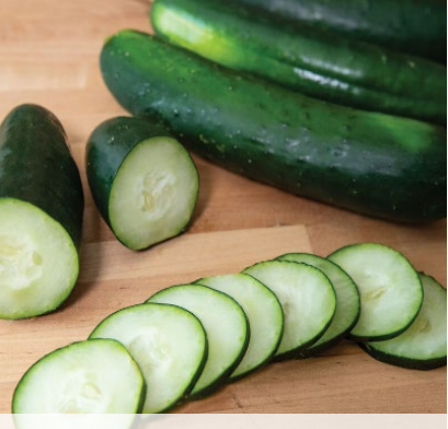
Cucumber - Gateway F1