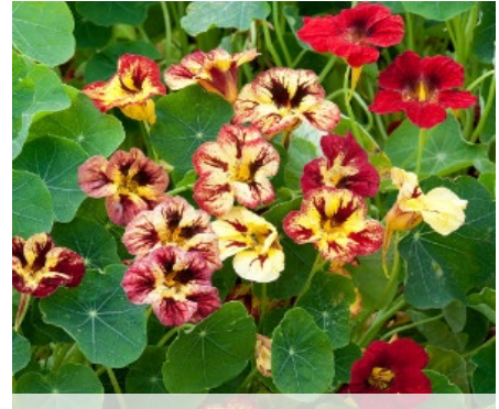
Nasturtium - Bloody Mary