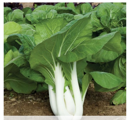
Pac Choi - Joi Choi