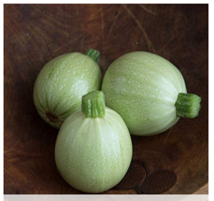
Zucchini - Cue Ball