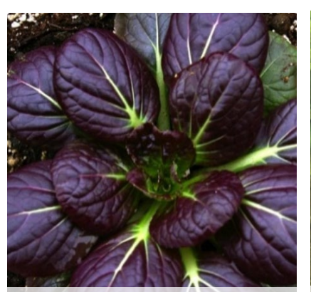
Tatsoi - Red