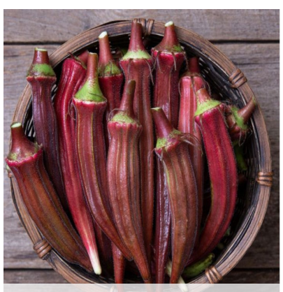
Okra - Red