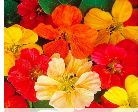
Nasturtium - Jewel Mix