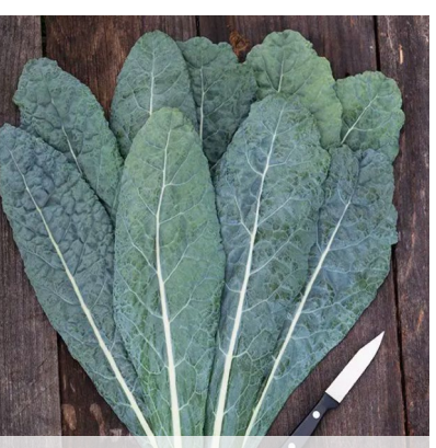
Kale - Dino/Black Magic