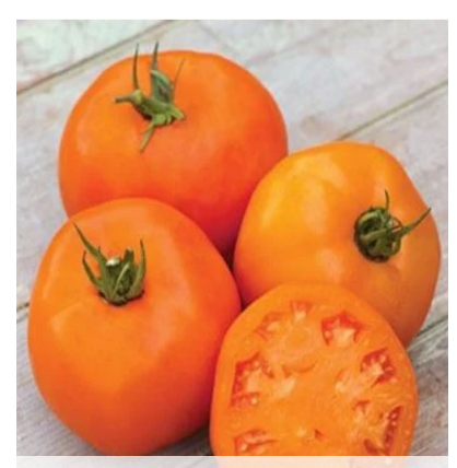
Tomato - Valencia