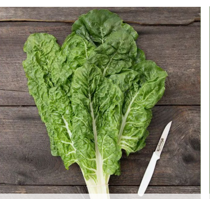
Swiss Chard - Fordhook