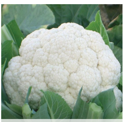
Cauliflower - White