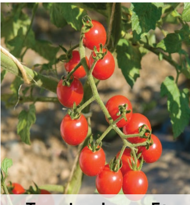
Tomato - Jasper F1