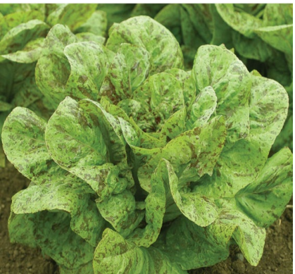
Lettuce - Flashy Trout's