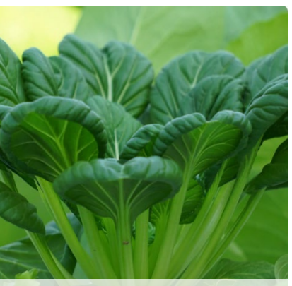
Tatsoi - Green