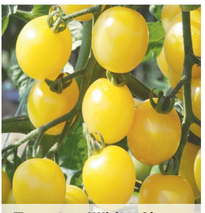
Tomato - White Cherry